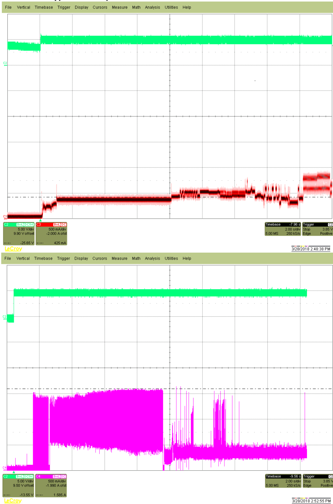
Figure 1. Typical 5V and 12V startup and operation current profiles